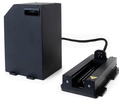
9155D-771/-779 in the Horizontal Configuration

Reference The Modal Shop's Sensor & Cal Tips #43-Long Stroke Precision Calibration Exciter