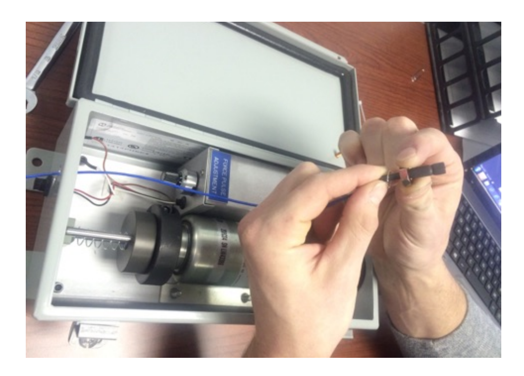
-Tighten cable to hammer shaft. Hand tighten cable to hammer shaft. Note: TURN WHOLE CABLE WHILE TIGHTING CABLE TO SHAFT. DO NOT KINK OR BIND CABLE IT IS VERY SENSITIVE

-Run hammer shaft end of new cable into box. Slide washer and nut onto cable.